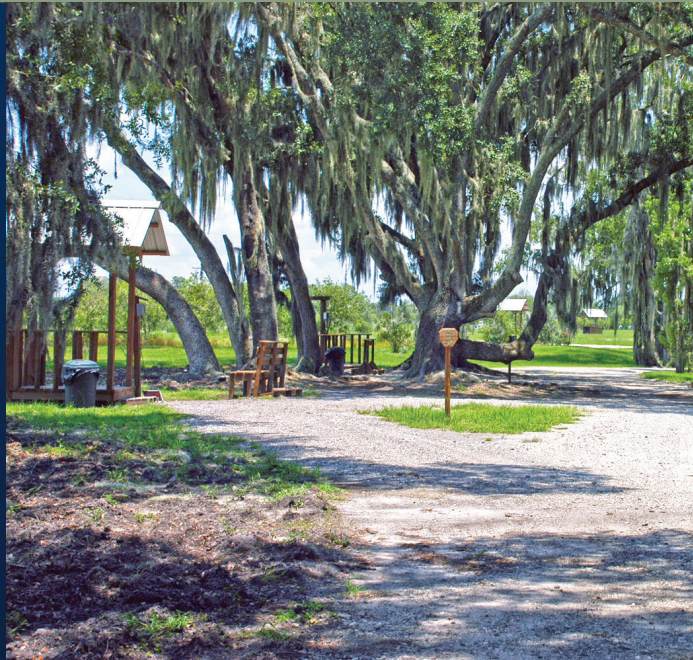
FISHHAWK SPORTING CLAY 13505 HOBSON SIMMONS RD, LITHIA, FL 33547