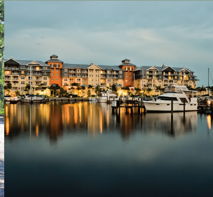
HARBORSIDE SUITES AT LITTLE HARBOR 536 BAHIA BEACH BLVD.